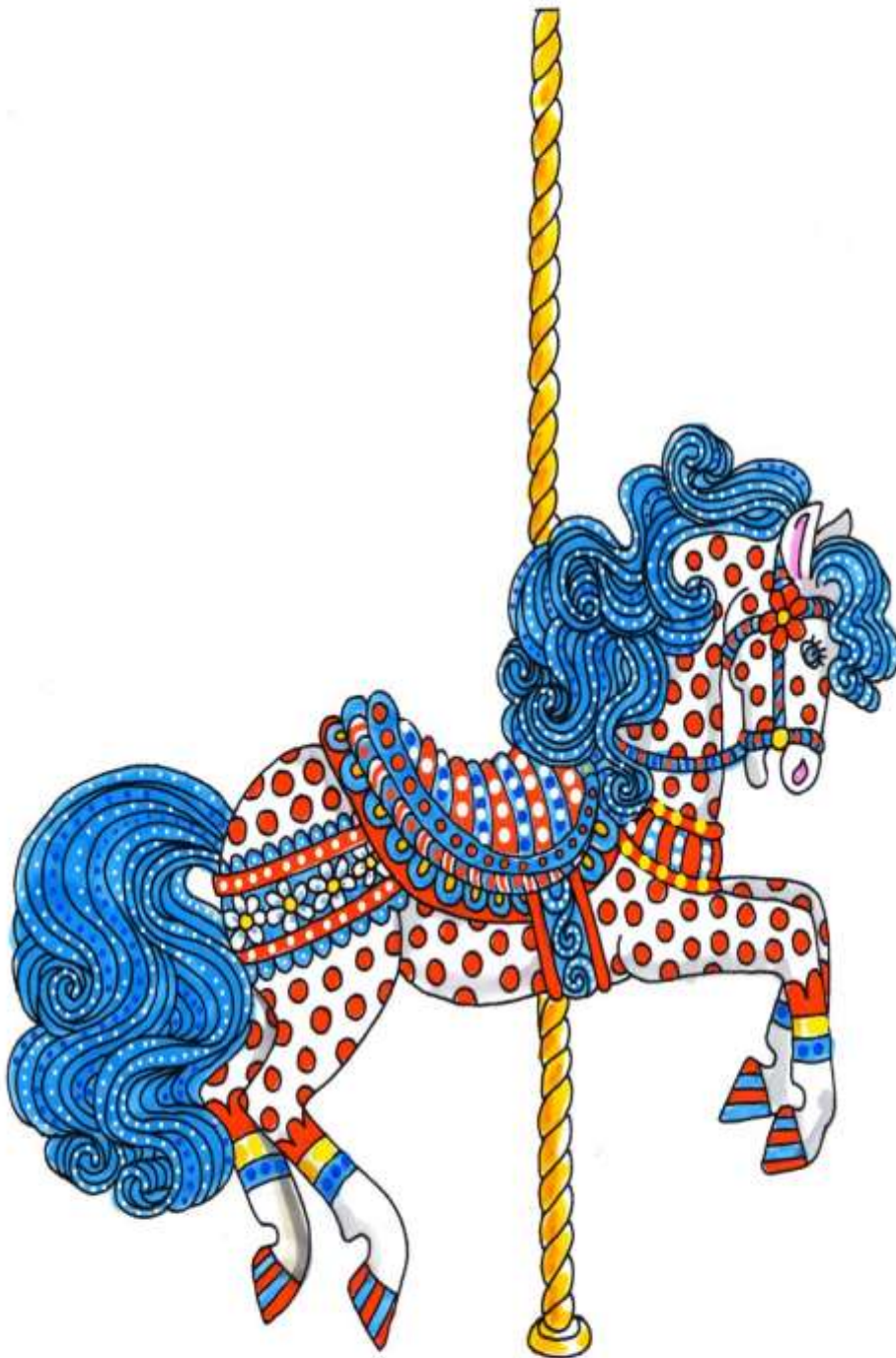
Carousel horse and Fair photos: Durell Godfrey