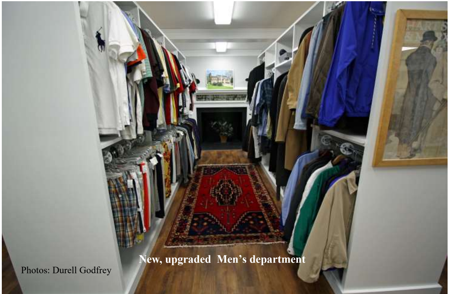
New, upgraded Men's department