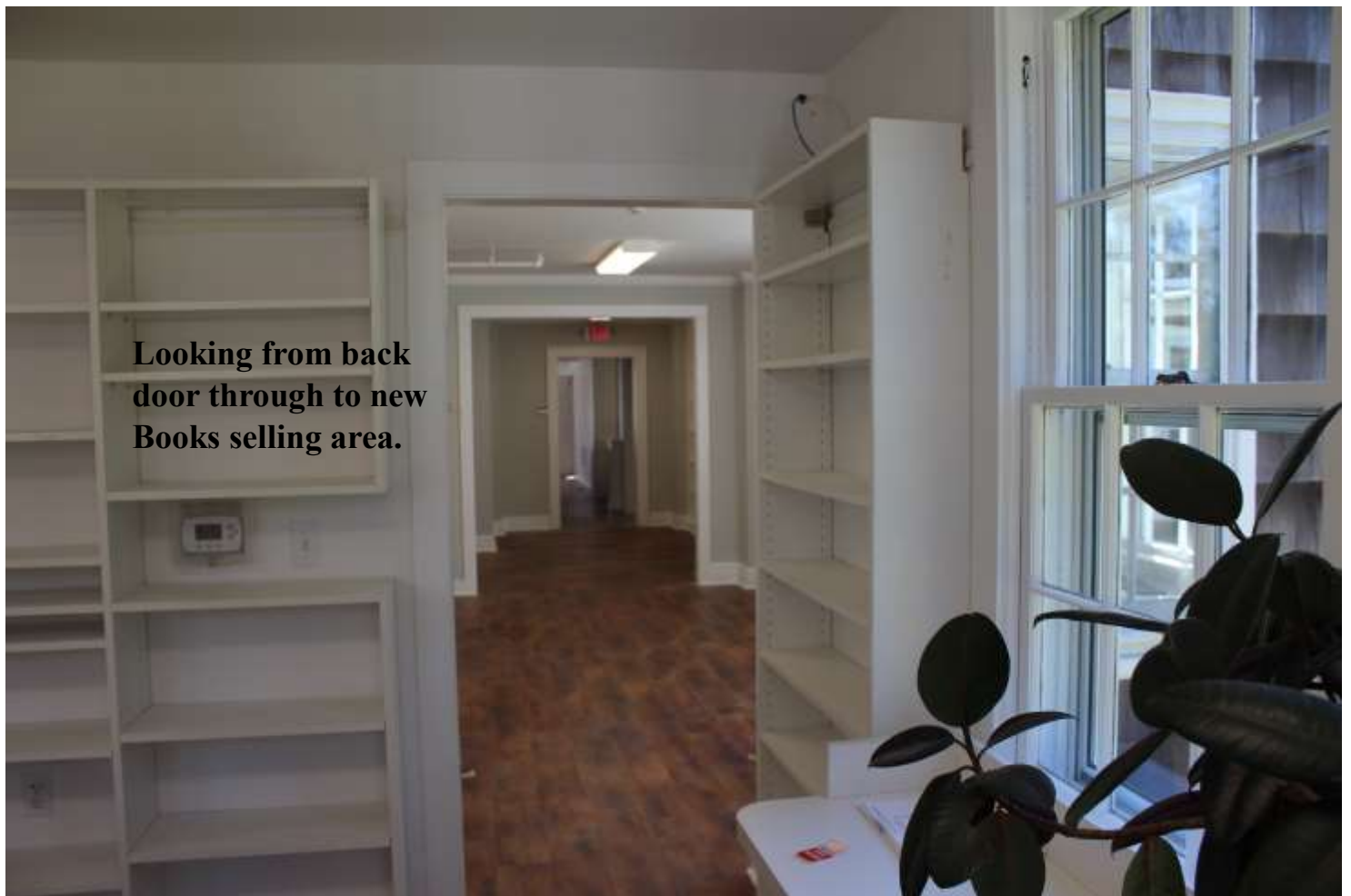
Looking from back door through to new Books selling area.