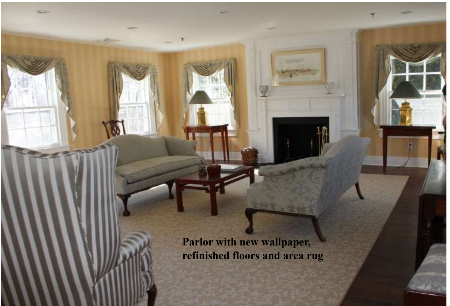
Parlor with new wallpaper, refinished floors and area rug