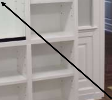
New glass case