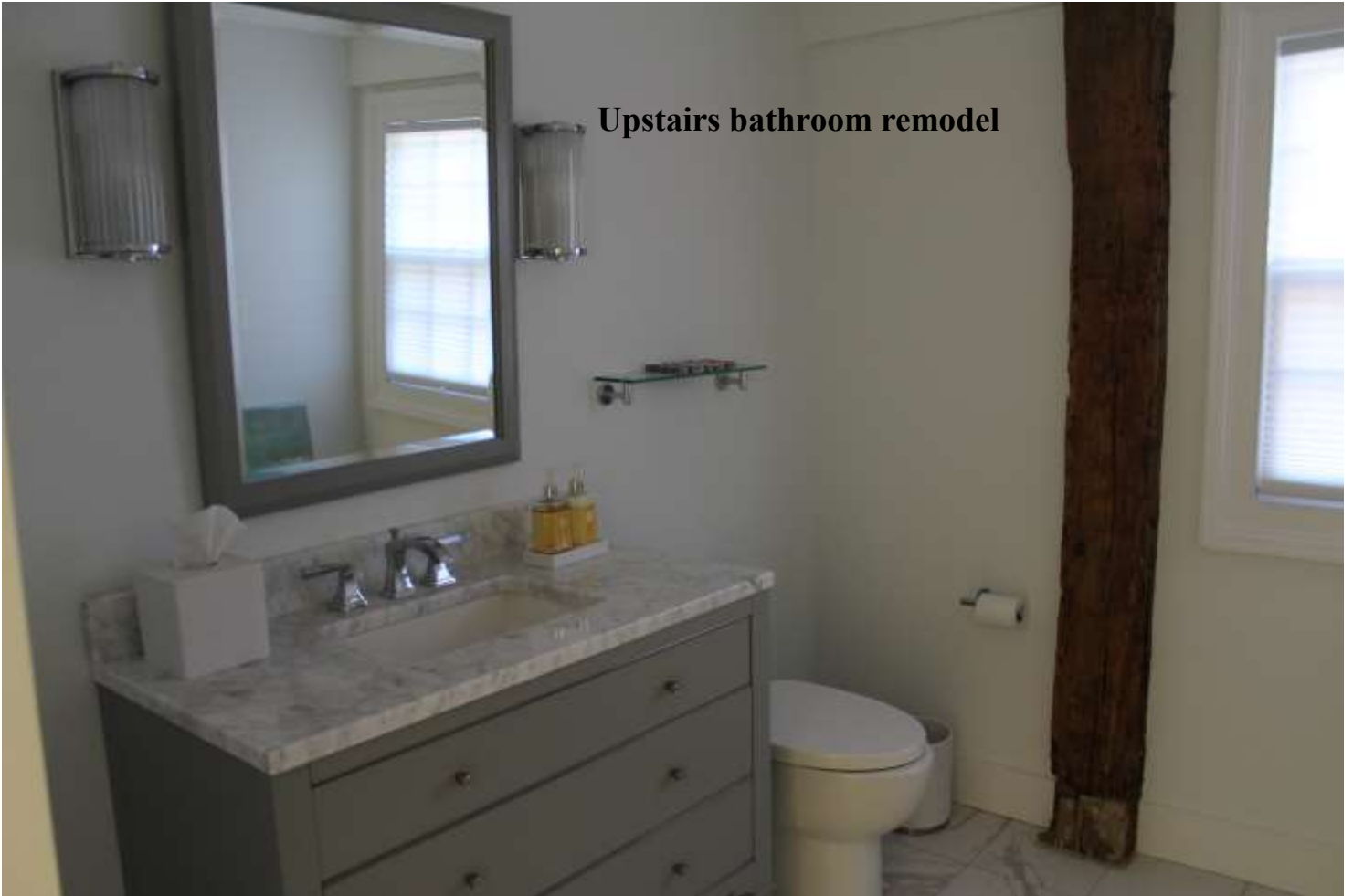
Upstairs bathroom remodel