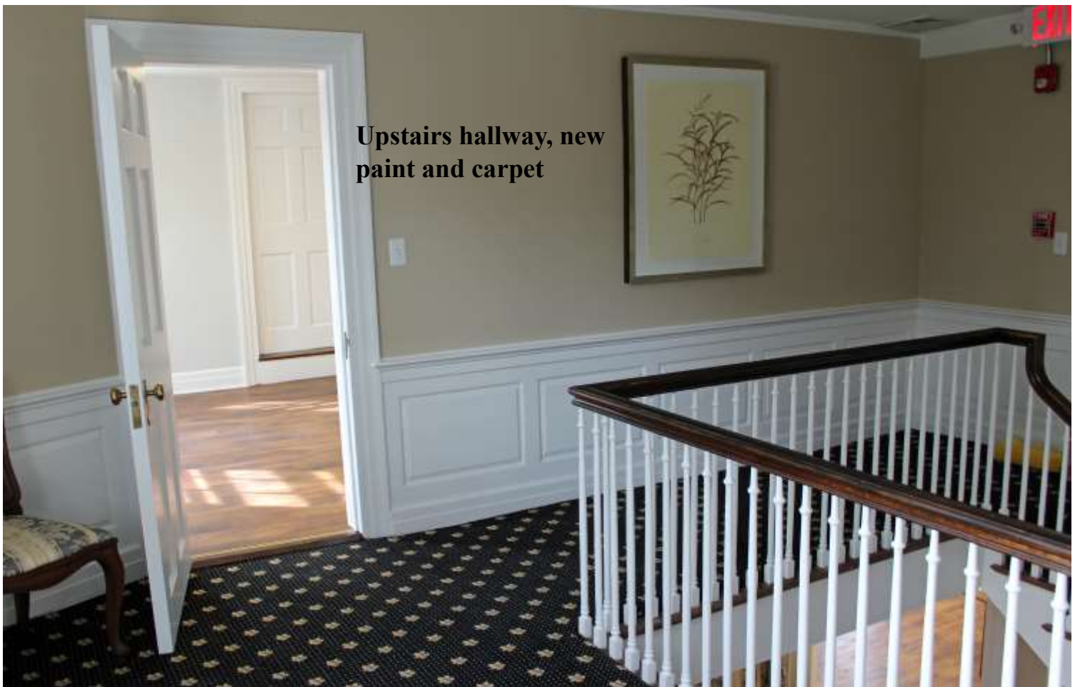
Upstairs hallway, new paint and carpet