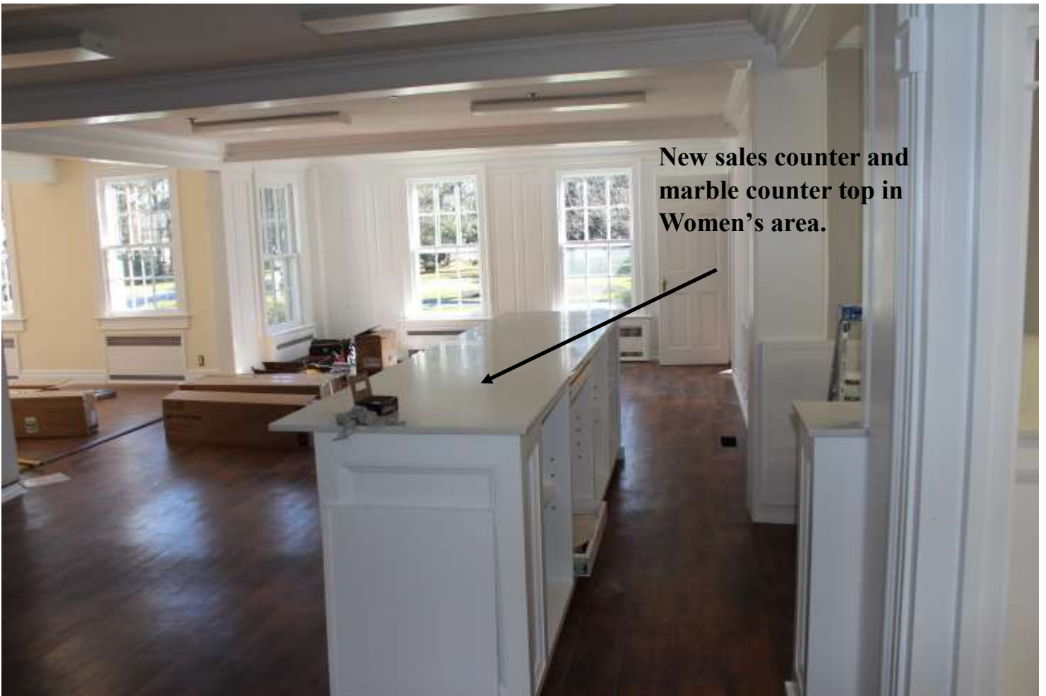
New sales counter and marble counter top in Women's area.