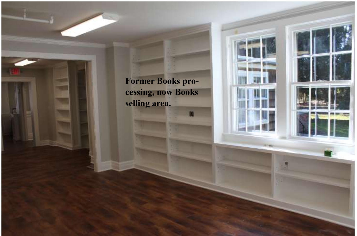
Former Books processing, now Books selling area.